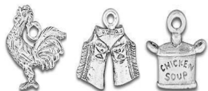
Rooster Chaps Chicken Soup

25 Roosters Country Kitchen 1515 Southgate 541-966-1100 Daily 7am-8:30pm